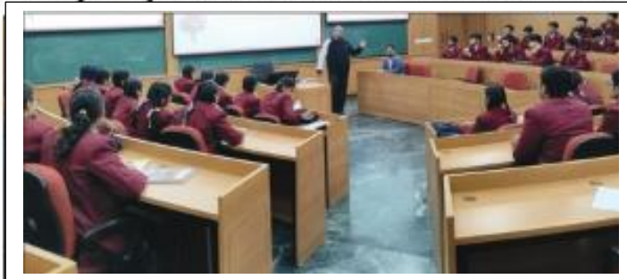
Students of Jawahar Navodaya Vidyalaya, Gharota receiving guidance and counselling at IIM Jammu.