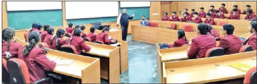
IIM Jammu faculty member addressing students of JNV Gharota on Friday.